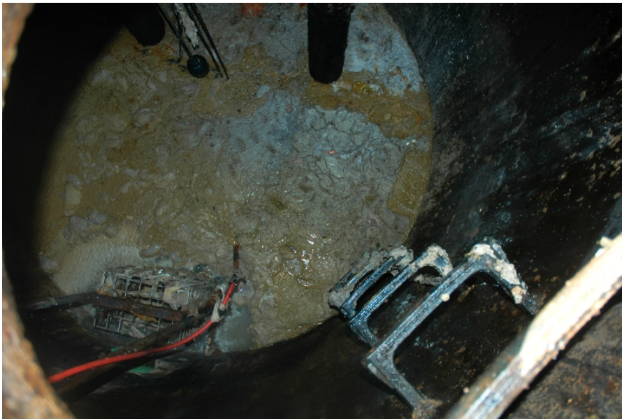
Figure 3. Untreated Wet Well at Lift Station

The following two pictures represent the visual nature of the results of VaporX treatments. The untreated photo was taken two weeks after the wet well was cleaned with a vacuum truck (Figure 3). Two weeks of FOG buildup is obvious in this picture. The second picture is a visual of the same wet well a few days after treatment with VaporX was initiated (Figure 4). This picture is representative of the consistent visual quality of the FOB situation within the wet well over the three months since the initiation of treatment.